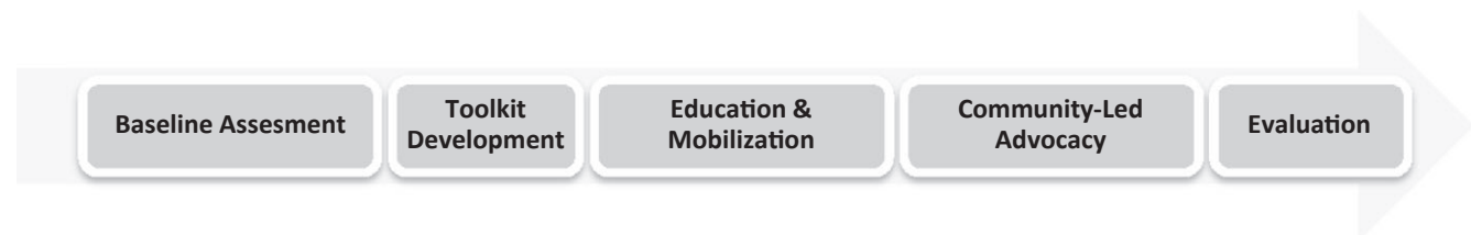
Figure 1. ITPC's Community Demand Creation Model.

To support the execution of the country awareness and advocacy plans developed during the workshops, small grants of US$10,000 are provided to national network partners. This step in the process is critical to ensuring that ideas are translated into action. Given the constrained funding environments that many national networks operate in, small grants provide dedicated funds for addressing the specific issues partners prioritize in their content.